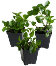
SHIPPED IN 3.25-INCH POTS. PLANT SIZE MAY VARY BASED ON GROWING CONDITIONS.

Note: Some leaves may appear wilted or yellow upon arrival. This is due to the stress of shipping and is nothing to worry about. Water the plant and let it recover in a shady location for a few days, then gently remove any foliage that does not recover to allow for new growth.