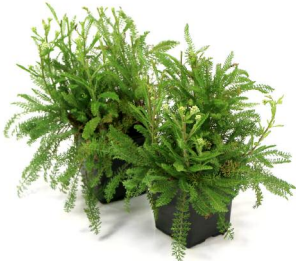
SHIPPED IN 4-INCH POTS. PLANT SIZE MAY VARY BASED ON GROWING CONDITIONS.

Note: Some leaves may appear wilted or yellow upon arrival. This is due to the stress of shipping and is nothing to worry about. Water the plant and let it recover in a shady location for a few days, then gently remove any foliage that does not recover to allow for new growth.