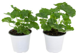
SHIPPED IN 4-INCH POTS. PLANT SIZE MAY VARY BASED ON GROWING CONDITIONS.

Note: Some leaves may appear wilted or yellow upon arrival. This is due to the stress of shipping and is nothing to worry about. Water the plant and let it recover in a shady location for a few days, then gently remove any foliage that does not recover to allow for new growth.