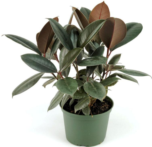
SHIPPED IN A 6-INCH POT. PLANT SIZE MAY VARY BASED ON GROWING CONDITIONS.

Note: Some leaves may appear wilted or yellow upon arrival. This is due to the stress of shipping and is nothing to worry about. Water the plant and let it recover in a shady location for a few days, then gently remove any foliage that does not recover to allow for new growth.