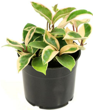
SHIPPED IN A 5.5-INCH POT. PLANT SIZE MAY VARY BASED ON GROWING CONDITIONS.

Note: Some leaves may appear wilted or yellow upon arrival. This is due to the stress of shipping and is nothing to worry about. Water the plant and let it recover in a shady location for a few days, then gently remove any foliage that does not recover to allow for new growth.