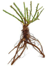
SHIPPED AS A BARE ROOT PLANT.

Note: The roots of your bare root rose are coated with Terra-Sorb® Hydrogel to protect them from drying out during handling and transport. It is suitable for planting and should be left on the roots at planting time.