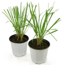
SHIPPED IN 4-INCH POTS. PLANT SIZE MAY VARY BASED ON GROWING CONDITIONS.

Note: Some leaves may appear wilted or yellow upon arrival. This is due to the stress of shipping and is nothing to worry about. Water the plant and let it recover in a shady location for a few days, then gently remove any foliage that does not recover to allow for new growth.