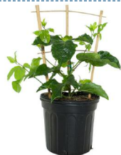
SHIPPED IN A 6-INCH POT. PLANT SIZE MAY VARY BASED ON GROWING CONDITIONS.

Note: Some leaves may appear wilted or yellow upon arrival. This is due to the stress of shipping and is nothing to worry about. Water the plant and let it recover in a shady location for a few days, then gently remove any foliage that does not recover to allow for new growth.