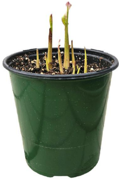
SHIPPED IN A 6-INCH POT. PLANT SIZE MAY VARY BASED ON GROWING CONDITIONS.

Note: Some leaves may appear wilted or yellow upon arrival. This is due to the stress of shipping and is nothing to worry about. Water the plant and let it recover in a shady location for a few days, then gently remove any foliage that does not recover to allow for new growth.