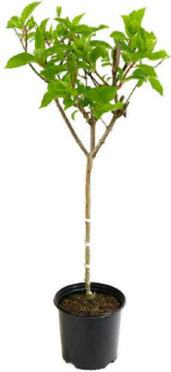
SHIPPED IN AN 8-INCH POT. PLANT SIZE MAY VARY BASED ON GROWING CONDITIONS.

Note: Some leaves may appear wilted or yellow upon arrival. This is due to the stress of shipping and is nothing to worry about. Water the plant and let it recover in a shady location for a few days, then gently remove any foliage that does not recover to allow for new growth.