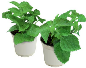
SHIPPED IN 2.5-INCH OR 4-INCH POTS. PLANT SIZE MAY VARY BASED ON GROWING CONDITIONS.