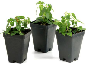
SHIPPED IN 2.5-INCH POTS. PLANT SIZE MAY VARY BASED ON GROWING CONDITIONS.

Note: Some leaves may appear wilted or yellow upon arrival. This is due to the stress of shipping and is nothing to worry about. Water the plant and let it recover in a shady location for a few days, then gently remove any foliage that does not recover to allow for new growth.