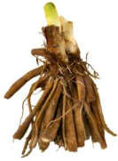
SHIPPED AS BARE ROOT DIVISIONS.

Upon arrival, your daylilies may have some green growth emerging from the top. Depending upon its length, some of the growth may be visible above the soil after planting. If you are unsure which direction to plant, simply plant the daylilies on their side. As they begin growing, they will orient themselves and grow just fine.