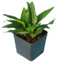
SHIPPED IN 3.25-INCH POTS. PLANT SIZE MAY VARY BASED ON GROWING CONDITIONS.

Note: Some leaves may appear wilted or yellow upon arrival. This is due to the stress of shipping and is nothing to worry about. Water the plant and let it recover in a shady location for a few days, then gently remove any foliage that does not recover to allow for new growth.