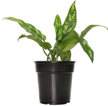
SHIPPED IN A 6-INCH POT. PLANT SIZE MAY VARY BASED ON GROWING CONDITIONS.

Note: Some leaves may appear wilted or yellow upon arrival. This is due to the stress of shipping and is nothing to worry about. Water the plant and let it recover in a shady location for a few days, then gently remove any foliage that does not recover to allow for new growth.