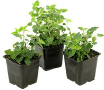
SHIPPED IN 3.25-INCH OR 4-INCH POTS. PLANT SIZE MAY VARY BASED ON GROWING CONDITIONS.

Note: Some leaves may appear wilted or yellow upon arrival. This is due to the stress of shipping and is nothing to worry about. Water the plant and let it recover in a shady location for a few days, then gently remove any foliage that does not recover to allow for new growth.