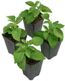
SHIPPED AS SHOWN

Note: Some leaves may appear wilted or yellow upon arrival. This is due to the stress of shipping and is nothing to worry about. Water the plant and let it recover in a shady location for a few days, then gently remove any foliage that does not recover to allow for new growth.