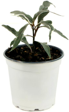
SHIPPED AS SHOWN

Note: Some leaves may appear wilted or yellow upon arrival. This is due to the stress of shipping and is nothing to worry about. Water the plant and let it recover in a shady location for a few days, then gently remove any foliage that does not recover to allow for new growth.