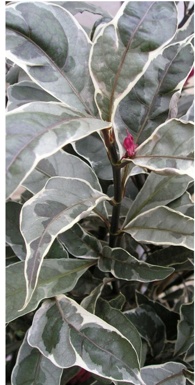
*Image on cover is representative of the type of plant(s) in this offer and not necessarily indicative of actual size or color for the included variety.