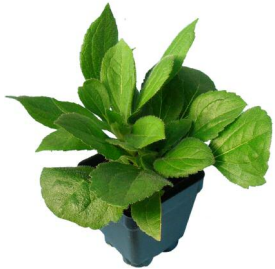
SHIPPED IN 3.25-INCH POTS. PLANT SIZE MAY VARY BASED ON GROWING CONDITIONS.

Note: Some leaves may appear wilted or yellow upon arrival. This is due to the stress of shipping and is nothing to worry about. Water the plant and let it recover in a shady location for a few days, then gently remove any foliage that does not recover to allow for new growth.