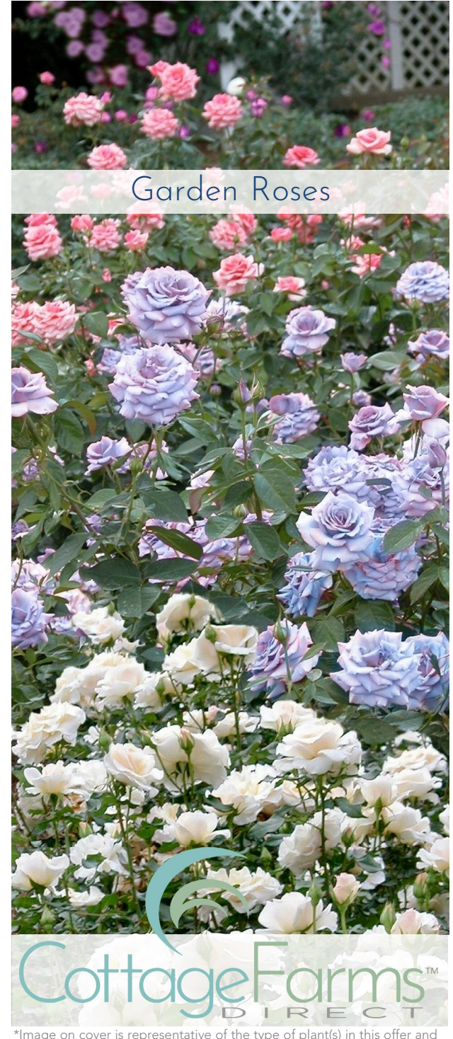
*Image on cover is representative of the type of plant(s) in this offer and not necessarily indicative of actual size or color for the included variety.