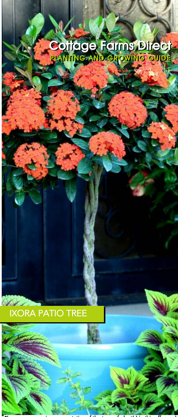
*Image on cover is representative of the type of plant(s) in this offer and not necessarily indicative of actual size or color for the included variety.

In case of ingestion contact a poison control center immediately. 1-800-222-1222