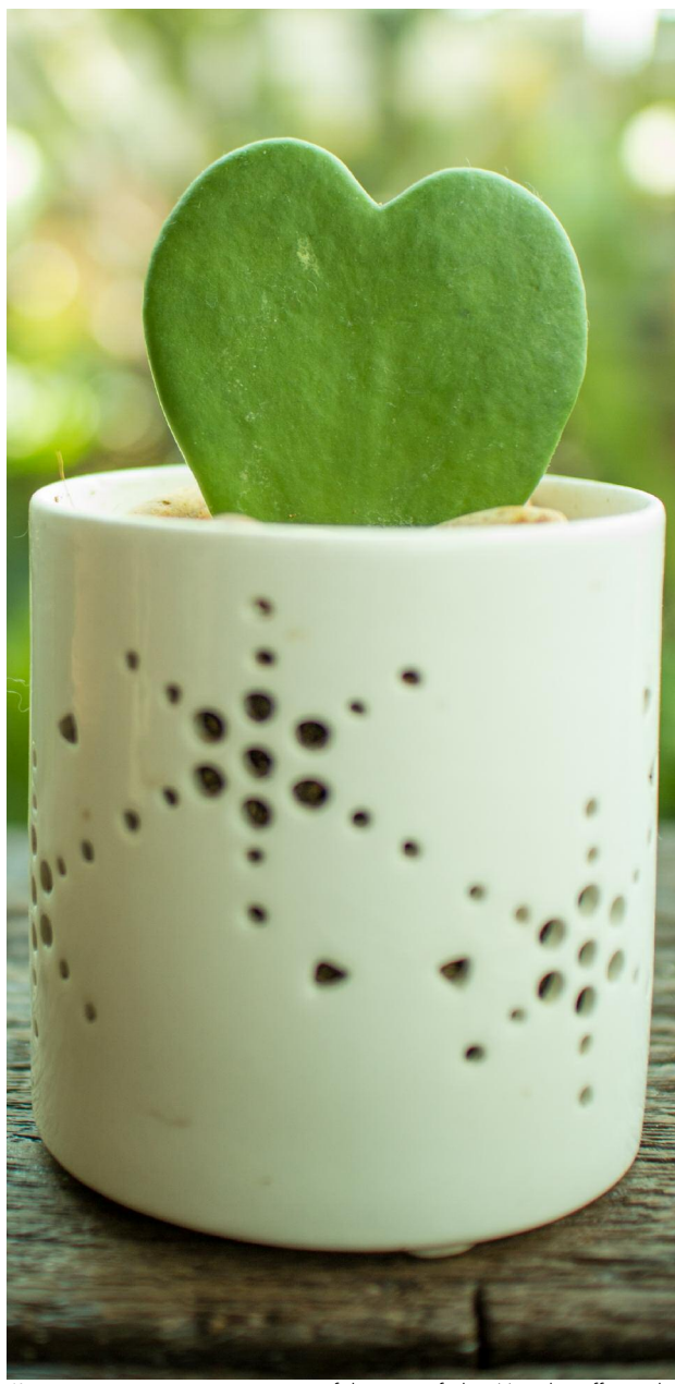
*Image on cover is representative of the type of plant(s) in this offer and not necessarily indicative of actual size or color for the included variety.