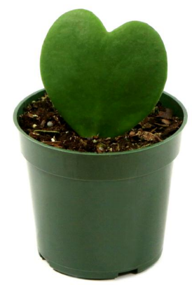
SHIPPED AS SHOWN

Note: Some leaves may appear wilted or yellow upon arrival. This is due to the stress of shipping and is nothing to worry about. Water the plant and let it recover in a shady location for a few days, then gently remove any foliage that does not recover to allow for new growth.