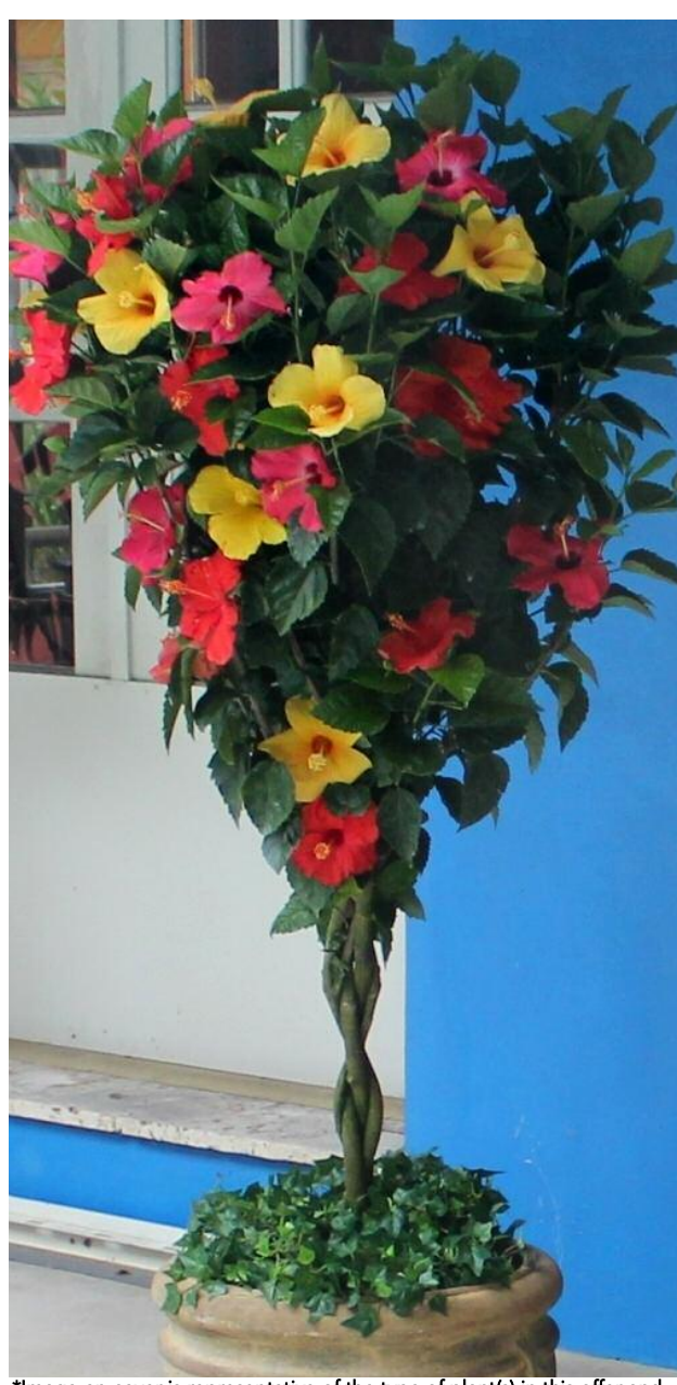
*Image on cover is representative of the type of plant(s) in this offer and not necessarily indicative of actual size or color for the included variety.