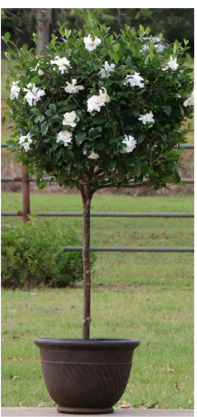
*Image on cover is representative of the type of plant(s) in this offer and not necessarily indicative of actual size or color for the included variety.