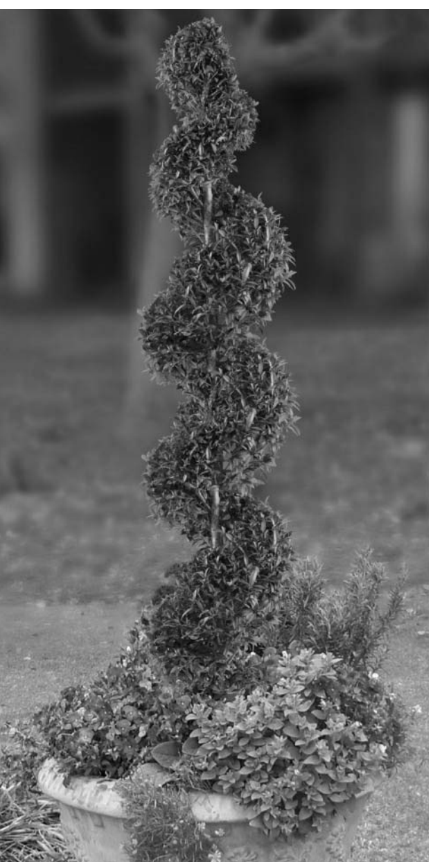
*Image on cover is representative of the type of plant(s) in this offer and not necessarily indicative of actual size or color for the included variety.