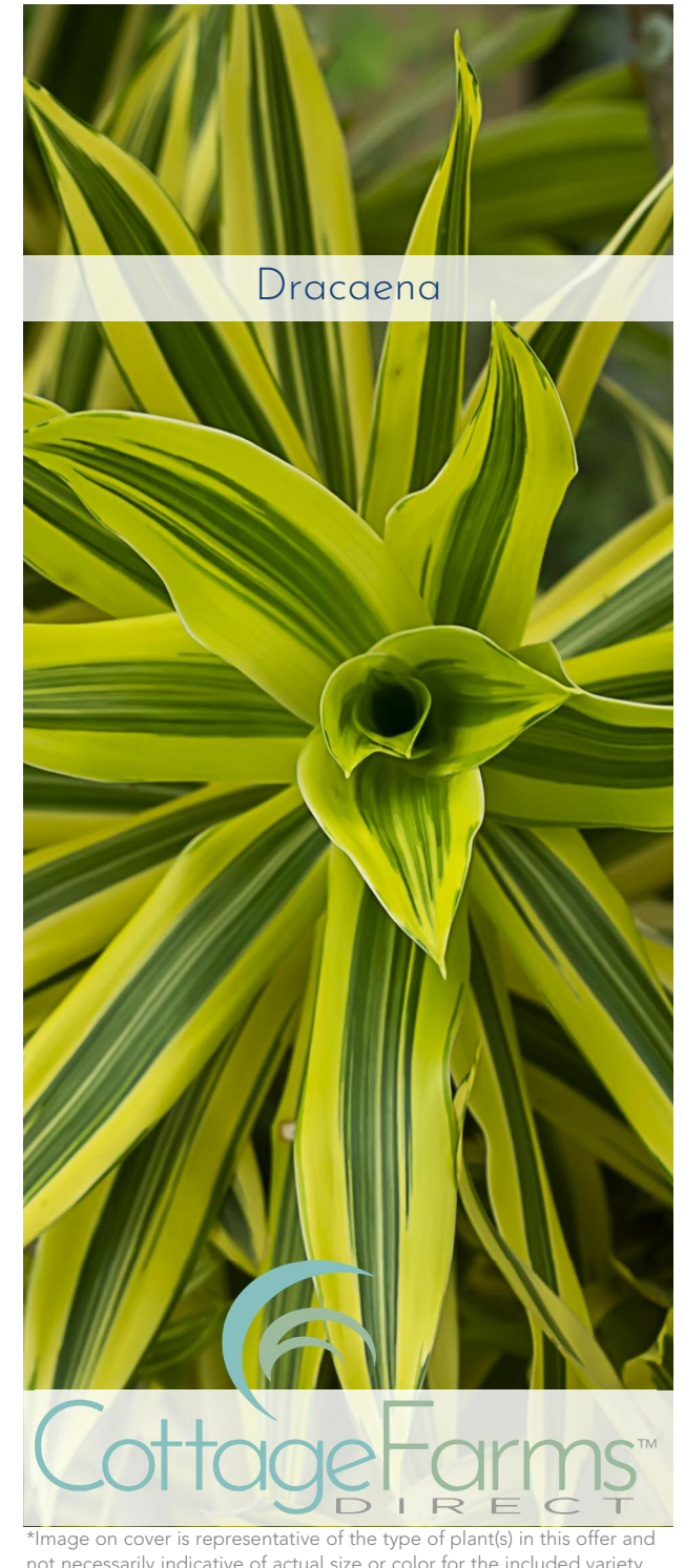
not necessarily indicative of actual size or color for the included variety.