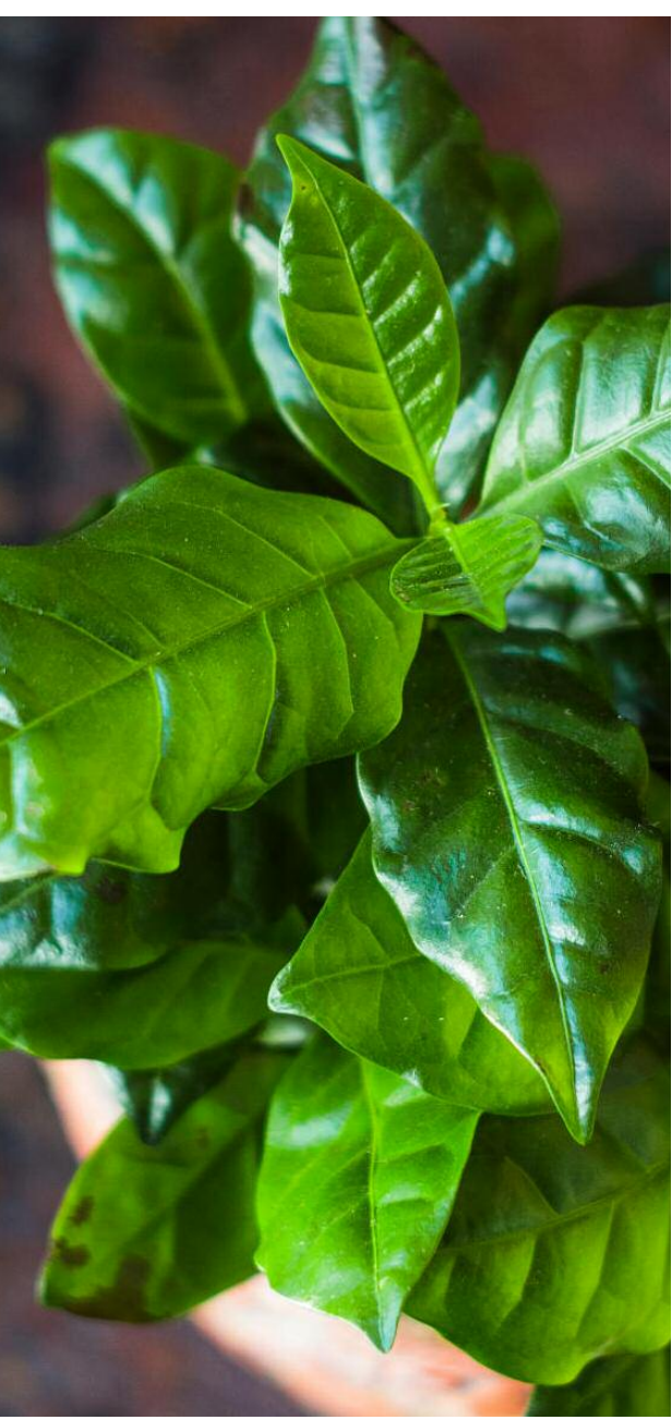
*Image on cover is representative of the type of plant(s) in this offer and not necessarily indicative of actual size or color for the included variety.