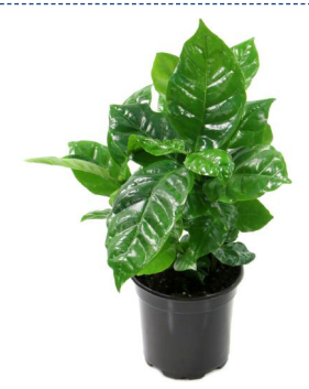
SHIPPED AS SHOWN

Note: Some leaves may appear wilted or yellow upon arrival. This is due to the stress of shipping and is nothing to worry about. Water the plant and let it recover in a shady location for a few days, then gently remove any foliage that does not recover to allow for new growth.