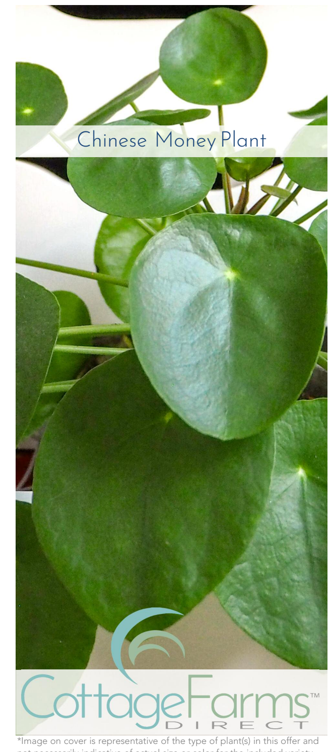
not necessarily indicative of actual size or color for the included variety.