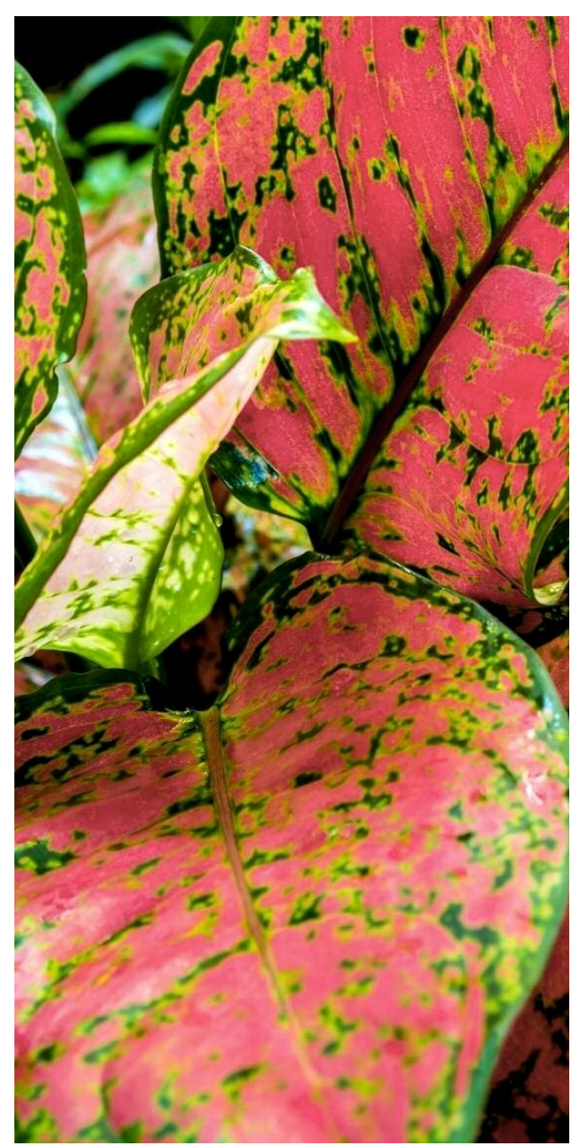
*Image on cover is representative of the type of plant(s) in this offer and not necessarily indicative of actual size or color for the included variety.