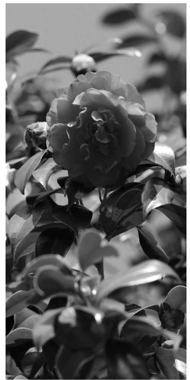
*Image on cover is representative of the type of plant(s) in this offer and not necessarily indicative of actual size or color for the included variety.