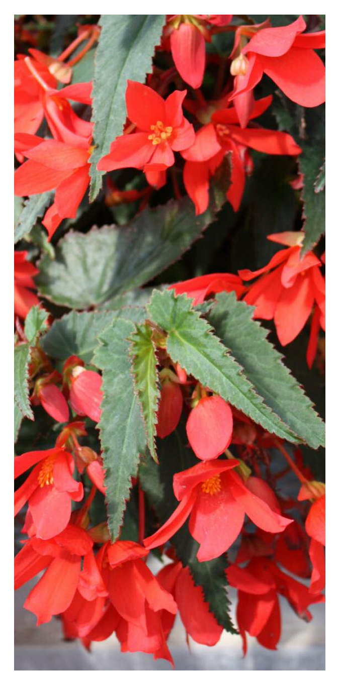
*Image on cover is representative of the type of plant(s) in this offer and not necessarily indicative of actual size or color for the included variety.